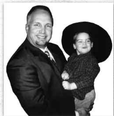
Garth Brooks and Hunter at the Teammates for Kids Convention .

Hunter's Dream For A Cure has presented $75,000 to Colorado's own Developmental Pathways . The Developmental Pathways' funded program assists children with special needs in the public school setting and provides training to teachers. Inspiration Playground has also received $50,000 from Hunter's Dream For A Cure to build the first universally-accessible playground in Colorado. Inspiration Playground is an outdoor play environment that includes safe, state of the art structures that enables every child - able bodied and disabled - to play independently on the same equipment. Other Colorado beneficiaries including Poudre Valley Children's Orthotic & Prosthetic Fund , Windsor Boardwalk Playground Project , Early Childhood Intervention , Breckenridge Outdoor Education Center , Wheelin' Sportsman , Outdoors Without Limits , Tony Semple Foundation , Union Colony Children's Music Academy , 24/7 Kids - Support for Families, Inc. , Rehabilitation and Visiting Nurse Association and many more have received donations totalling more than $500,000 from Hunter's Dream for a Cure .